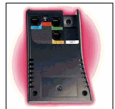
Colored port labels